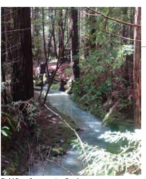
Field Day: Conservation Fund